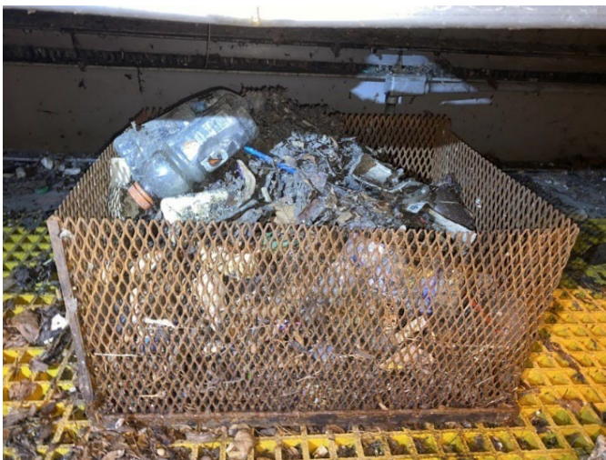
Gatorade plastic bottle on the conveyer belt at the Hamburg Drain Floatables Control Facility, observed December 14, 2022.