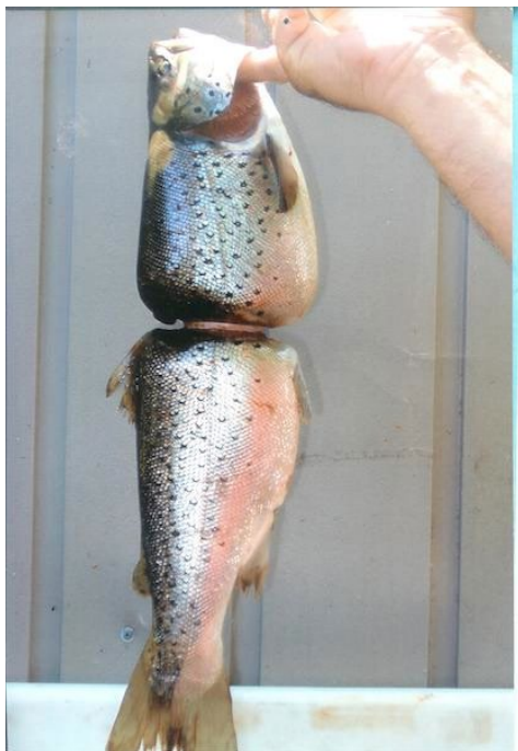
A rainbow trout, a species that also inhabits the Buffalo River, captured in Lake Ontario deformed by a plastic bottle ring.

on the Buffalo River or its tributaries and are commonly eaten by humans and other animals.