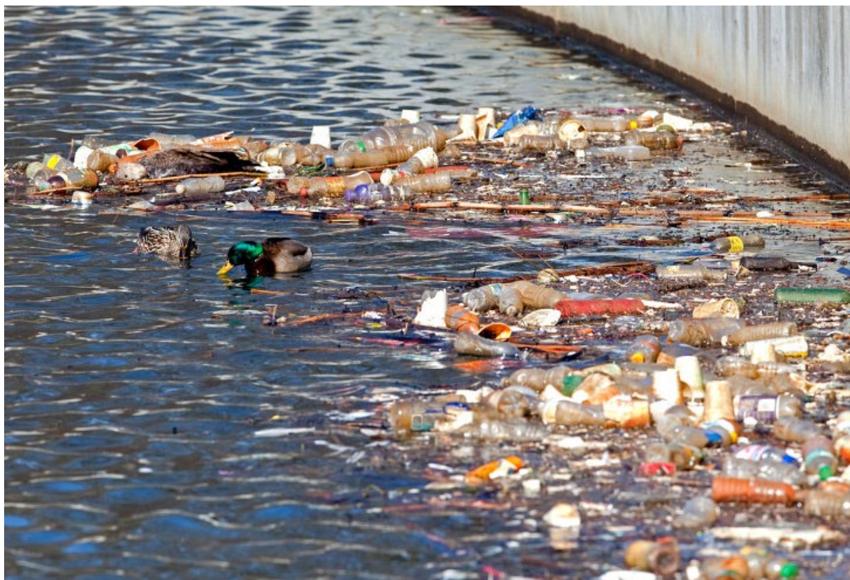
Mallard ducks feeding in a mass of floating waste.

71. Birds that inhabit the Buffalo River and its environs, such as mallard ducks, loons, and cormorants, are known to ingest plastic pollution, mistaking it for food. As a consequence, they can suffer from weakness, irritation of the stomach lining, digestive tract blockage, internal bleeding, abrasion, ulcers, failure to put on fat stores necessary for migration and reproduction, absorption of toxins, and even potential death through starvation.