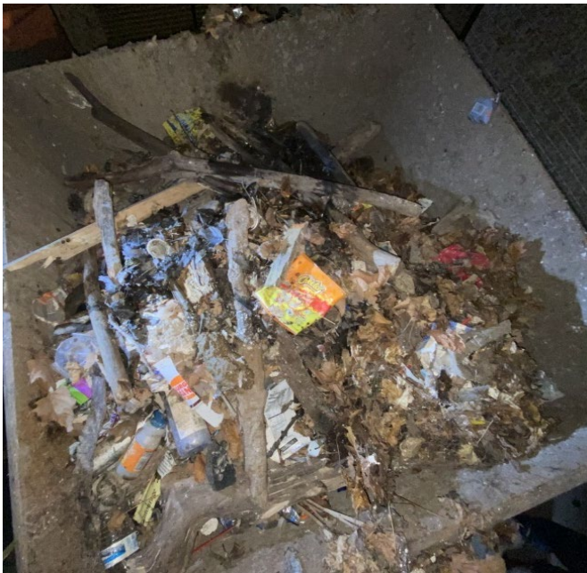
Cheetos snack wrapper in the hopper at the Hamburg Drain Floatables Control Facility, observed December 14, 2022.

79. The accumulation of single-use plastic waste in the Buffalo River, to which PepsiCo substantially contributes, is also a factor in the ongoing need for the Hamburg drain system, constructed and operated at great public expense. Nearly half of branded trash items observed during two site visits to the Hamburg Drain Floatables Control Facility were plastic beverage bottles or plastic snack food wrappers produced by PepsiCo.