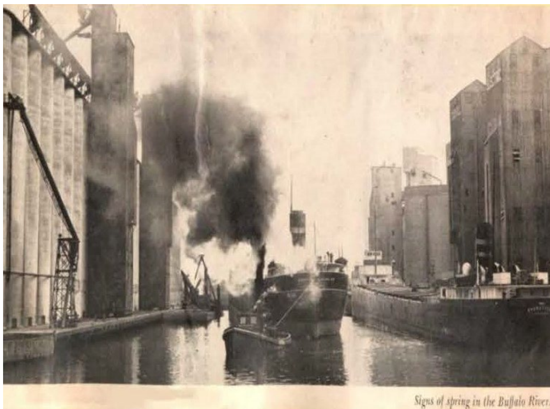
The Buffalo River in April 1951.

30. The Buffalo River was once considered one of the most polluted rivers in the United States. Discharges from grain milling and manufacturing industries that operated along the river in the late 1800s and at the turn of the century, along with chemical and sewer discharges, had so polluted the river that it was devoid of fish by the 1920s. Extensive dredging to deepen and widen the river for navigation during this time also damaged the river's ecosystem. As late as the 1960s, the river was considered biologically dead.