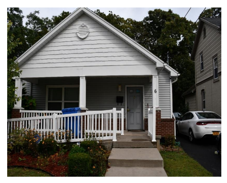
6 Vinewood Place on September 15, 2021. Dedrick James's 2013 White Dodge Dart is in the driveway on the right.

Consistent with these protocols, on September 15, 2021, fourteen members of the Task Force arrived at 6 Vinewood Place to arrest Mr. James.