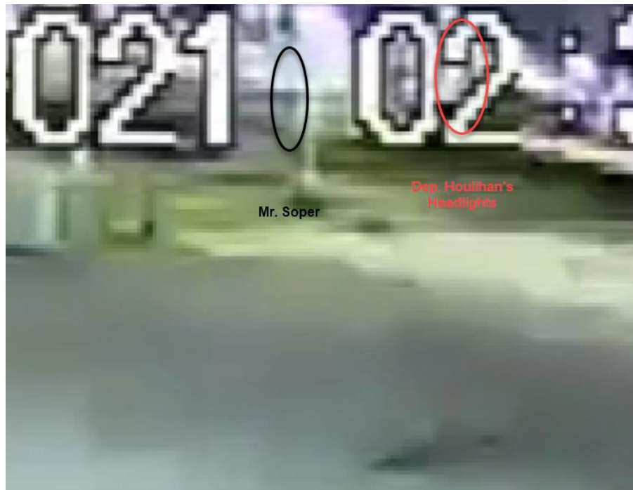
Image taken from close-up of surveillance footage captured from the north wall of Walgreens showing Mr. Soper and the headlights from Dep. Houlihan's patrol car captured less than one second after the preceding image.