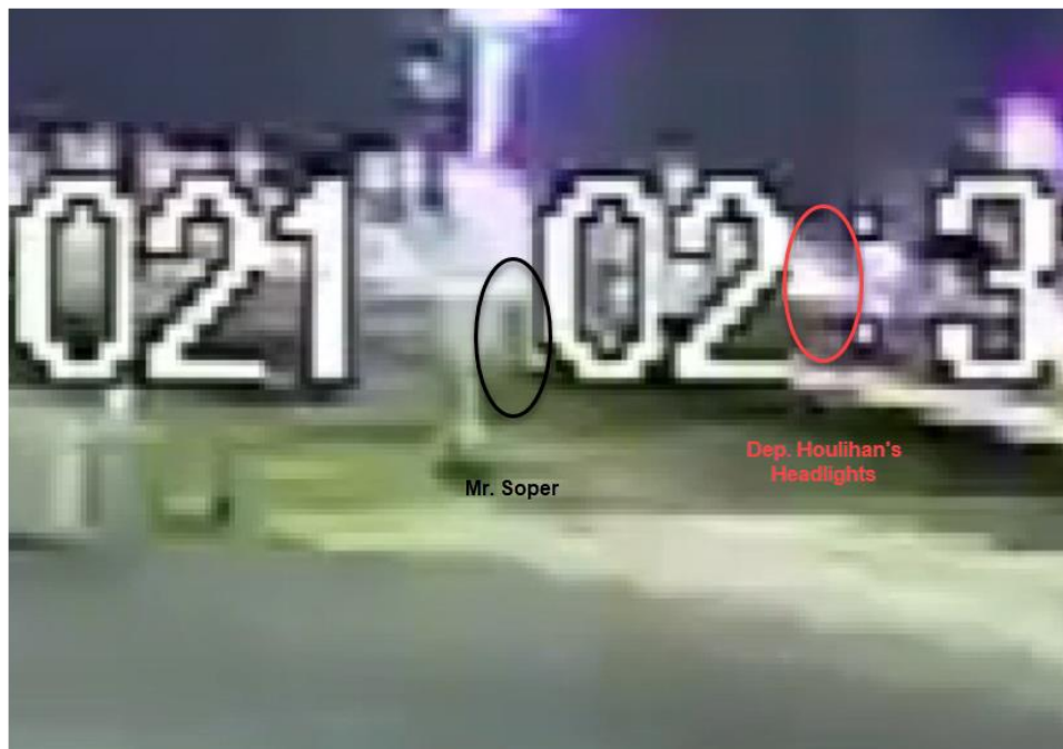
Image taken from close-up of surveillance footage captured from the north wall of Walgreens showing Mr. Soper and the headlights from Dep. Houlihan's patrol car.

Although there is no overhead surveillance video at the intersection, a camera mounted on the northern wall of a Walgreens store captured Dep. Houlihan's car approaching the intersection and Mr. Soper (faintly and from a distance) walking, without stopping or pausing, into the road. That footage, made for and kept by Walgreens, contained irremovable date and time stamps that obscured the collision. Close-up still photos taken from that video, are below.