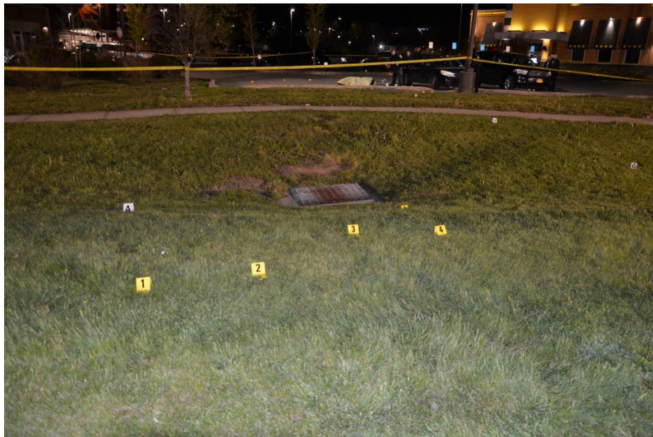
Crime scene photograph of ballistic evidence shown by numbered yellow flags, and the bodies under the yellow covering in the parking lot.

OSI canvassed for video in the surrounding area. OSI went to the Buffalo Wild Wings to request relevant video and was told the surveillance system was not working; the Buffalo Wild Wings