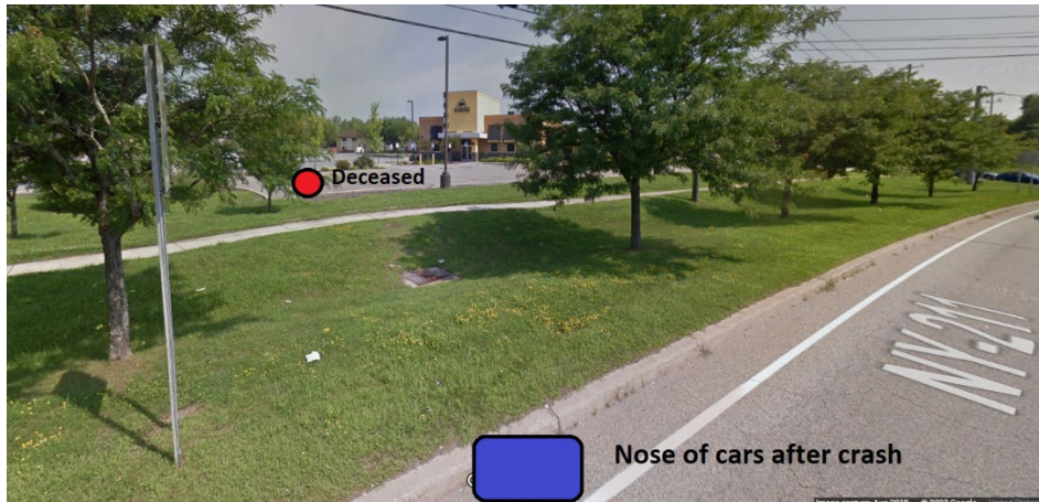
Google maps photograph of the approximate locations of the crash and the bodies.