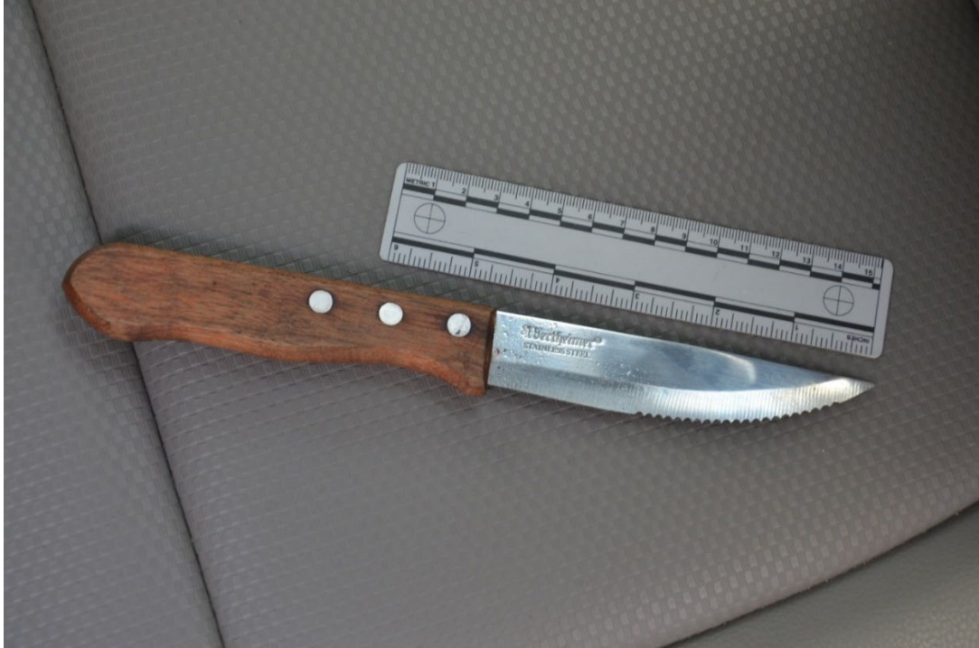
Picture of the knife recovered on the ground in the parking lot.